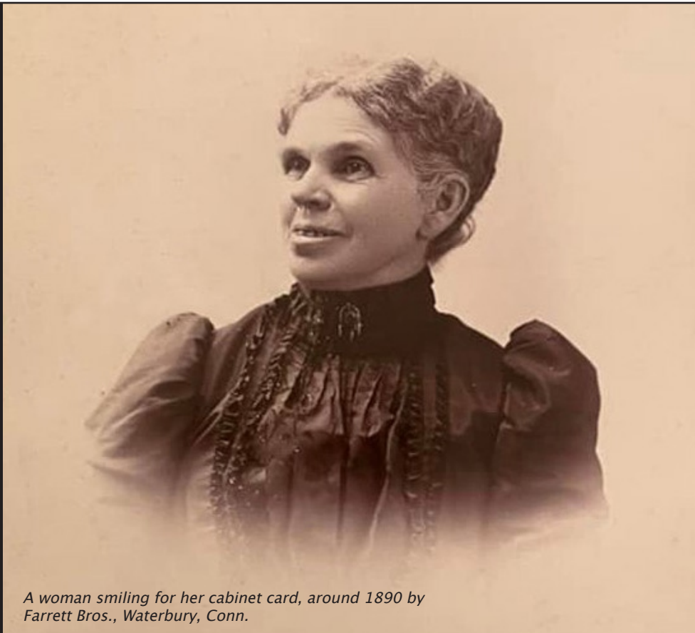
A woman smiling for her cabinet card, around 1890 by Farrett Bros., Waterbury, Conn.

Please go to the link here, to register for this event: https://www.penningtonlibrary.org/preservephotos/